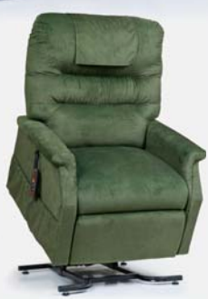
Monarch Large PR-355L