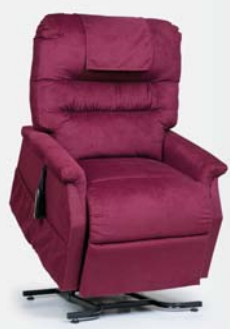
Monarch Plus Large PR-359L