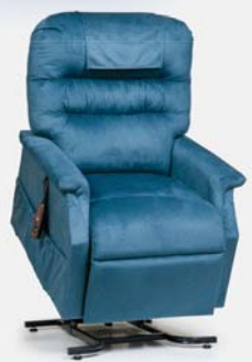
Monarch Plus Medium PR-359M