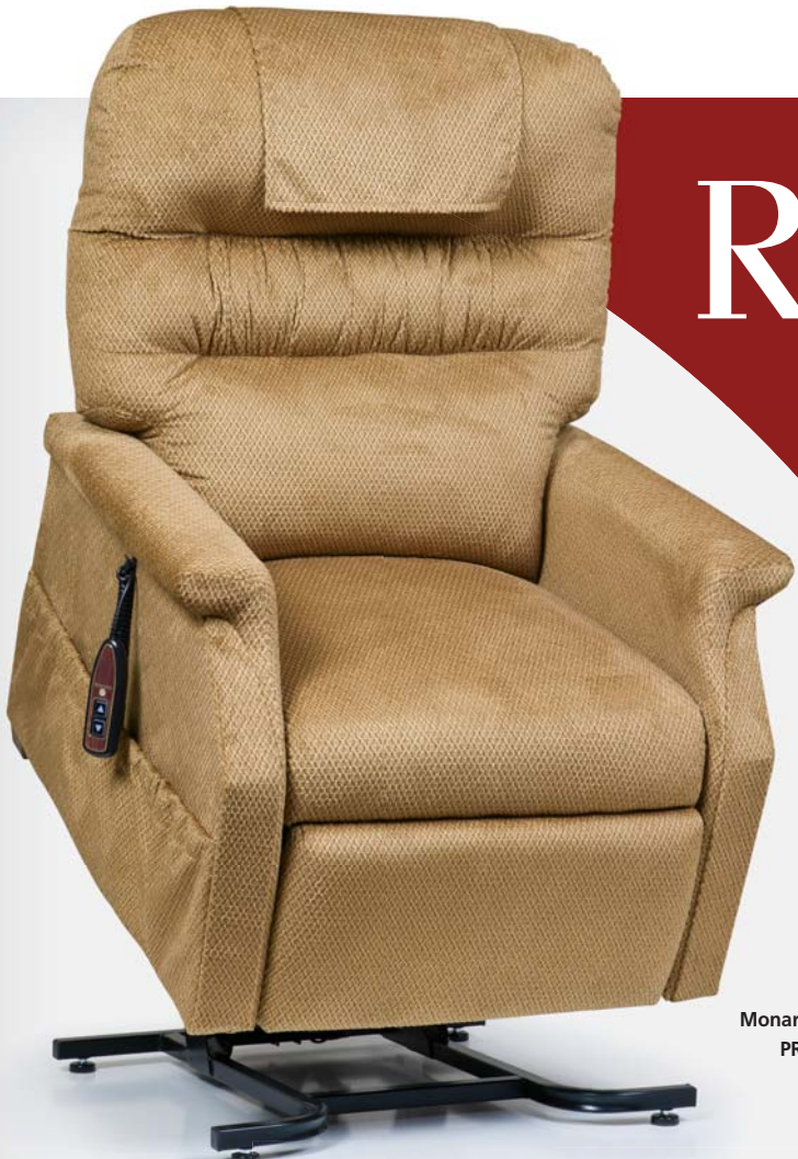
Monarch Medium PR-355M